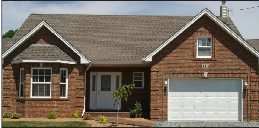
MAIN FLOOR - 1350 sq.ft.